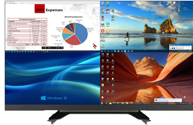
PBP (Picture by picture) Up to 4 signal input, splicing mode selection