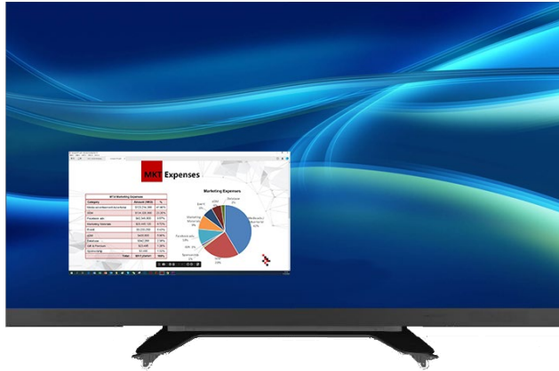
PIP (Picture-in-picture) Picture can be zoomed and moved freely

It supports up to four separate signal inputs